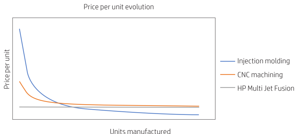
Price per unit evolution for injection molding, CNC machining and HP Multi Jet Fusion

Plus, the ease of use, ease of cleaning and predictability of HP MJF technology optimizes operator time and the operator skill-set required, which can ultimately help reduce labor costs.